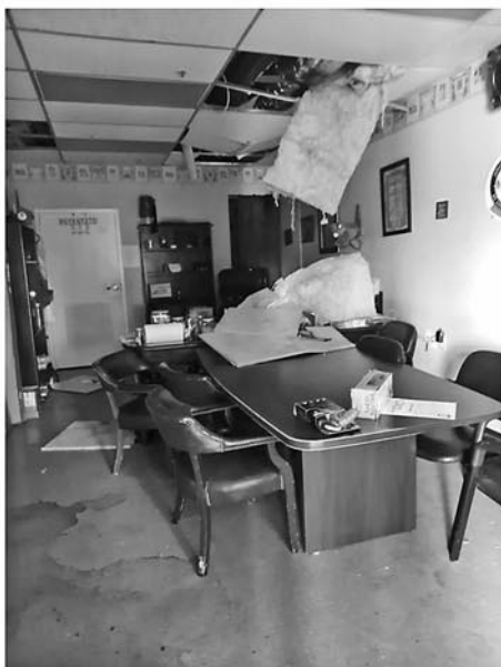
Damage at Jerusalem Shriners temple was extensive. In addition, nearly 100,000 customers remain without power in Louisiana and are in need of assistance.